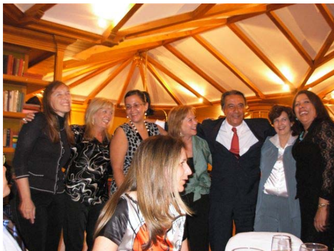
The 5th Pan American Congress of Audiology & 2nd Latin American Congress on Cochlear Implants was held in Bogota, Columbia in November of 2007. Editors note: It looks like a fun group – at least the lone male (with the big smile) in the picture appears to be having fun.

We will be presenting annual reports and financial statements to the members in Hong Kong. Suffice it to say for now, that ISA is healthy, growing, dynamic, and making a strong contribution on the world scene. We want to continue to grow and continue to do what needs to be done for hearing, the hearing impaired, audiology, and our members. We can only accomplish that goal if you, our members, tell us what needs to be done, work on your committees, help to write ISA position papers and documents, and serve as officers in your organization. Please let us hear from you! ❖